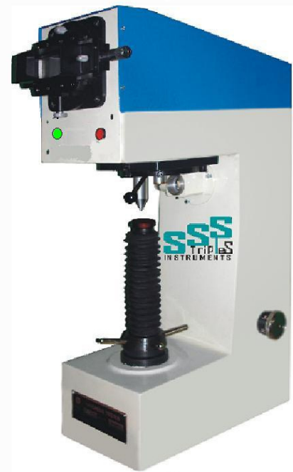
VICKERS HARDNESS TESTER MODEL : SSS-VM-50

To accommodate the high precision loading system & an optical projection screen, the machine frame is designed study. Specimen is placed on a testing table. The test cycle is fully automatic. The accurate load is applied on a diamond penetrator by means of a lever & weights. The load is removed automatically after a specific lapse of time. The objective is indexed with the test piece & the diamond indentation is projective is indexed with the test piece & the diamond indentation is projected on the measuring screen. The diagonals of the indentation can be measured by means of the micrometer screw of the projection screen