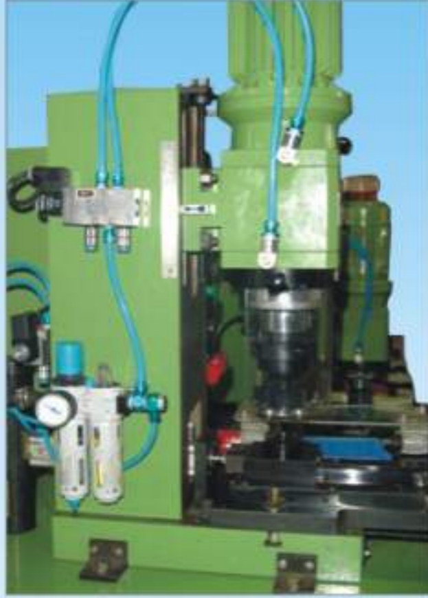
Riveting Machine with Roll Forming Attachment & Pneumatic Sliding Fixture