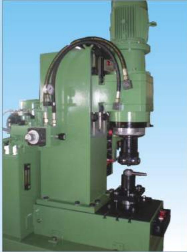
Ball Joint Assembly – roll forming