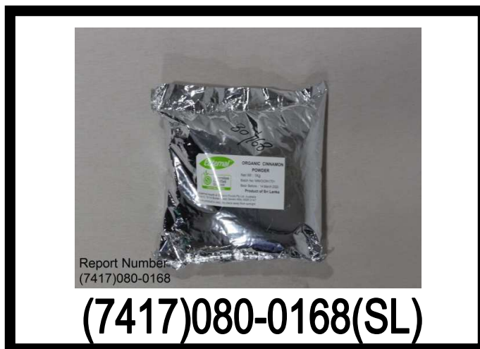
Photo of the Submitted Sample

Bureau Veritas Consumer Products Services Lanka (Pvt) Ltd.