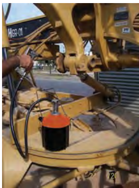
Common sight on construction equipment requiring high volume routine greasing