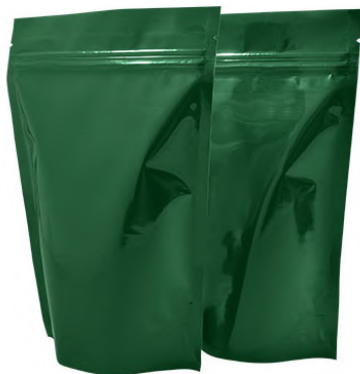
Green / Green