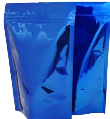
Blue / Blue