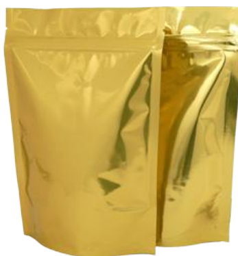
Shiny Gold / Shiny Gold