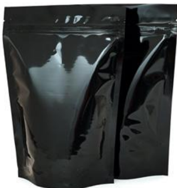
Shiny Black/Shiny Black