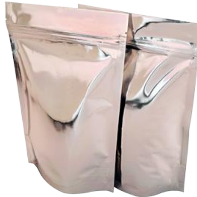
Shiny Silver/Shiny Silver