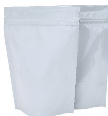
Matt White / Matt White