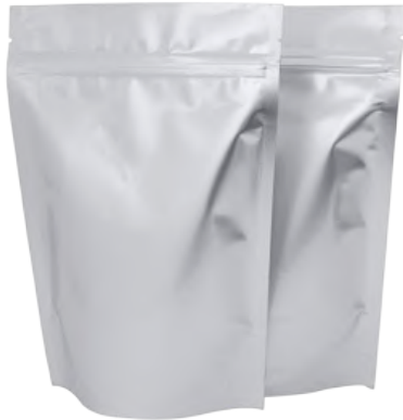
Matt Silver/Matt Silver