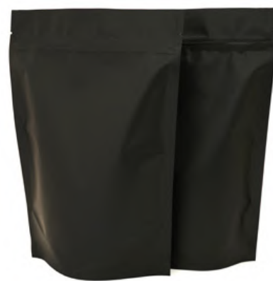
Matt Black/Matt Black