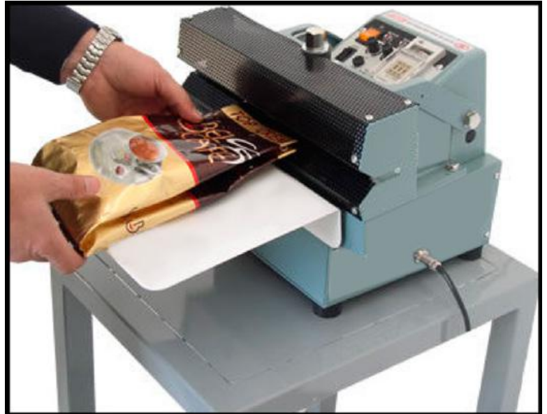
(b) Foot Operated Heat Sealer For startup companies/ For high quality sealing/ For multiple layers sealing