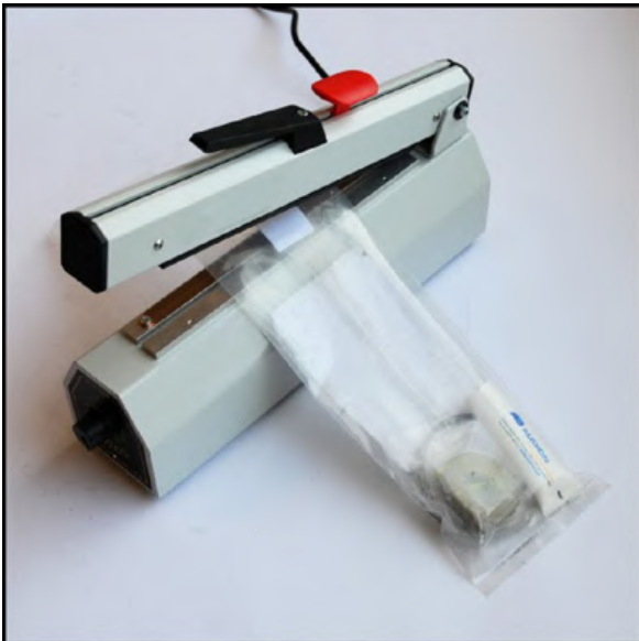
(a) Hand Heat Sealer For Startup Companies