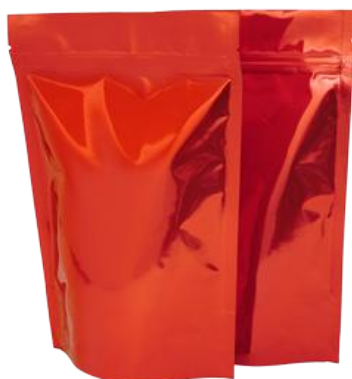
Red / Red