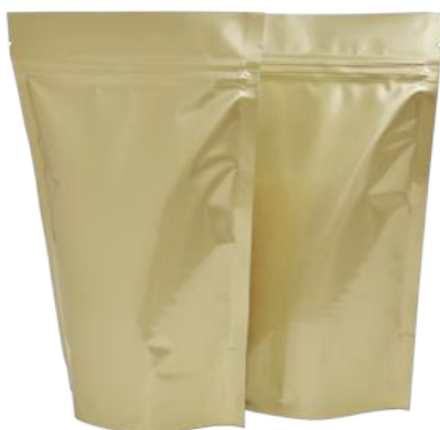
Matt Gold / Matt Gold