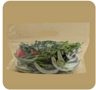
Stand up Pouch & Handle