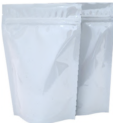
Shiny White / Shiny White