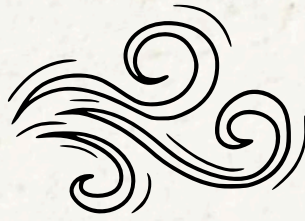
Blow volume detection