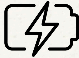
Built-in Li-ion Battery (1200mAh)