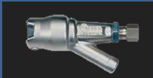
Wet sand Blasting Nozzle