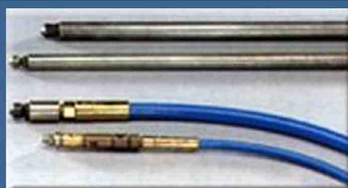
Rigid and Flexible High Pressure Lances