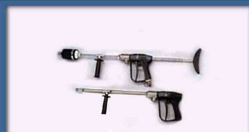
High Pressure Jetting Guns