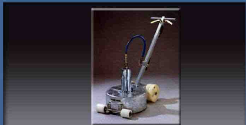
Hydrojet Surface Cleaner