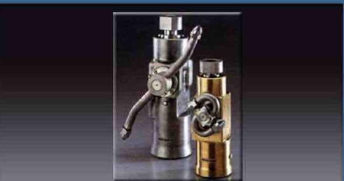
Hydrojet Automatic Tank Cleaner