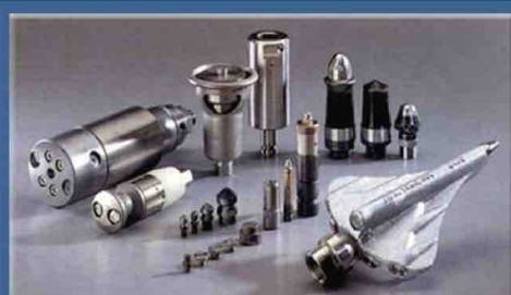
Hydrojet Cleaning Nozzles