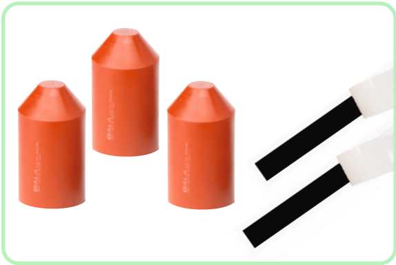
Un-screened Sealing Kit upto 11 kV