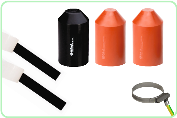
Screened Sealing Kit with Ground upto 36 kV

End Sealing Kit for RMU extensible / GIS Bushing is used to seal and insulate the ends of Bushings & also protect it from ingress of water / moisture. The caps used in End Sealing Kits are manufactured from high quality Cross-linked Non-tracking and Semiconductive Polyolefin material. Compatible with all types of Bushings. The caps need to be removed from the Bushings for new connections.