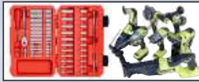
Electronics Tool Kit