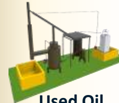
Used Oil Recycling Plant