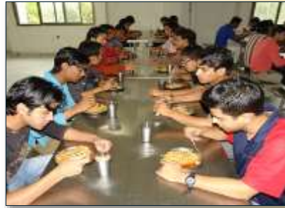
At Mess & Canteen