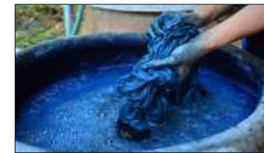
Fabric Dye Shops