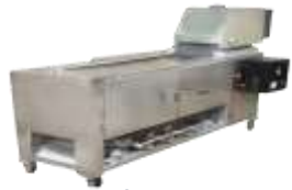
Automaking Roti Making Machine