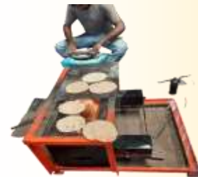
Roti Maker Biomass Stove