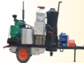
Portable Biomass Gasifier