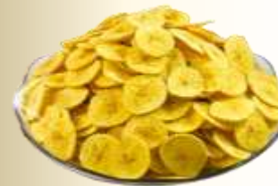
Banana Chips Manufacturers