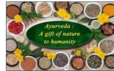
Ayurvedic Medicine Manufacturers