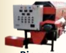
Biomass Torrefaction Plant (Charcoal Plant)