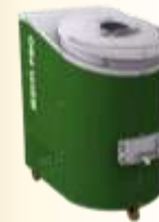
Multi-Purpose Food Processing Machine