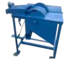
Wood Cutter / Biomass Shredder