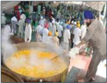
To Prepare Langar at Gurdwara