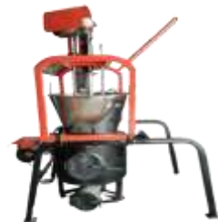
Biomass based Automatic Mawa-Machine