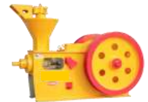
Biomass Briquette Pellet Machine