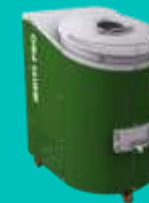
Multi-Purpose Food Processing Machine