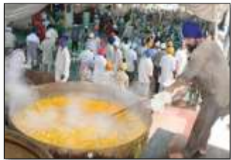
To Prepare Langar at Gurdwara