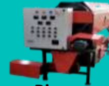
Biomass Torrefaction Plant (Charcoal Plant)