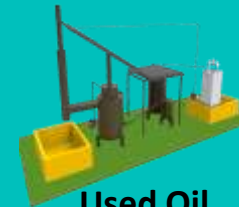
Used Oil Recycling Plant