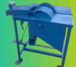
Wood Cutter / Biomass Shredder