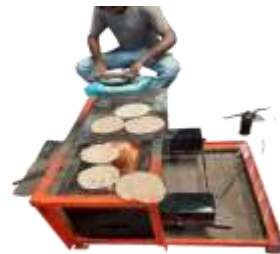
Roti Maker Biomass Stove