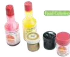
Food Flavor & Food Colors Manufacturers