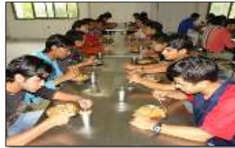
At Mess & Canteen