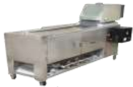
Automaking Roti Making Machine