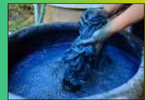
Fabric Dye Shops