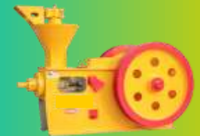
Biomass Briquette Pellet Machine