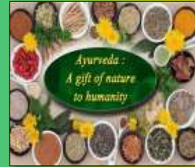
Ayurvedic Medicine Manufacturers