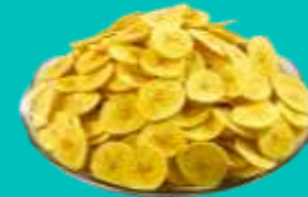
Banana Chips Manufacturers