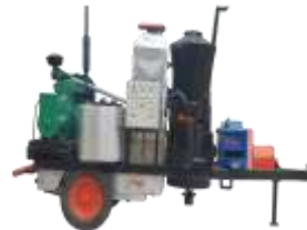
Portable Biomass Gasifier