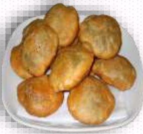
At Kachori Stall