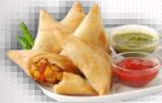
At Samosa Stall