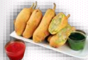
At Pakora & Snack Shops