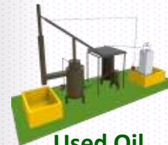
Used Oil Recycling Plant