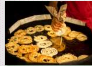
At Jalebi Shops