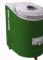
Multi-Purpose Food Processing Machine