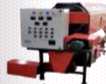
Biomass Torrefaction Plant (Charcoal Plant)