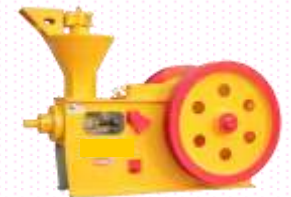
Biomass Briquette Pellet Machine