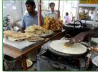
At Street Food Stalls