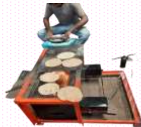
Roti Maker Biomass Stove