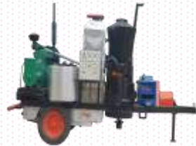
Portable Biomass Gasifier