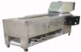
Automaking Roti Making Machine