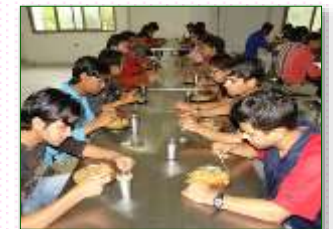
At Mess & Canteen