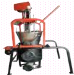
Biomass based Automatic Mawa-Machine