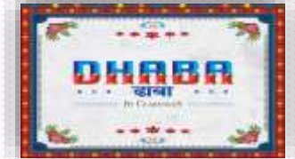
At Hotel, Dhaba & Restaurant