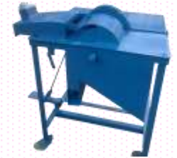
Wood Cutter / Biomass Shredder