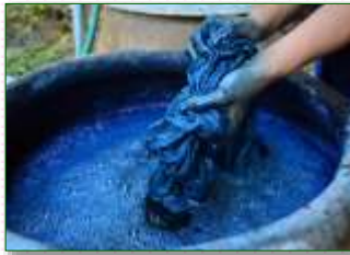
For Fabric Dye Shops