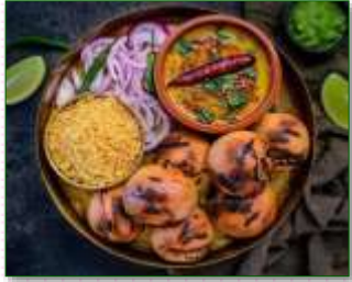
For Daal-Bati- Churma Makers