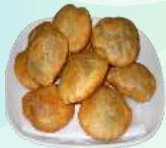
At Kachori Stall