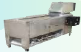
Automaking Roti Making Machine