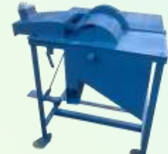
Wood Cutter / Biomass Shredder