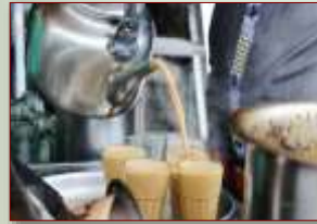
At Tea & Coffee Stall