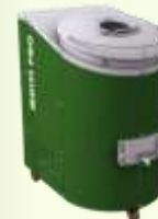
Multi-Purpose Food Processing Machine