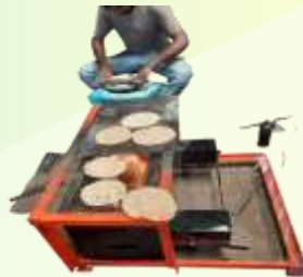
Roti Maker Biomass Stove