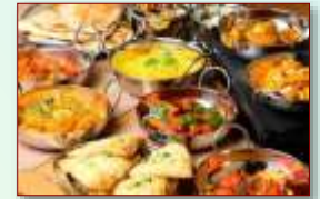
Prepare Food for 50-60 People