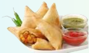
At Samosa Stall