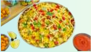
At Poha Stalls