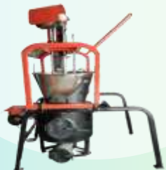
Biomass based Automatic Mawa-Machine