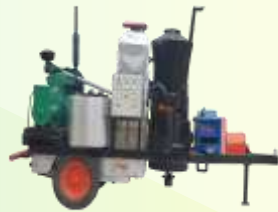
Portable Biomass Gasifier