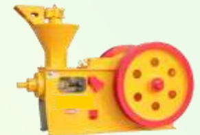
Biomass Briquette Pellet Machine