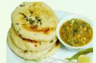
At Chhole- Kulcha Stall