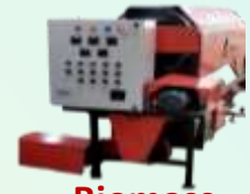
Biomass Torrefaction Plant (Charcoal Plant)