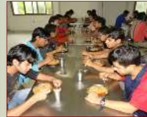
At Mess & Canteen