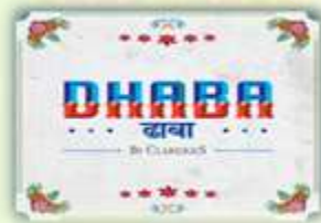
At Hotel & Dhaba