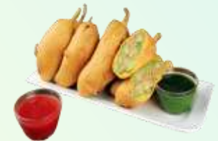
At Pakora & Snack shops