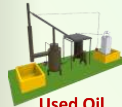
Used Oil Recycling Plant