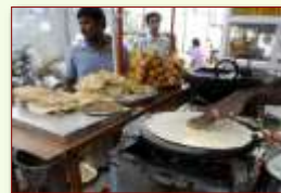
At Street Food Stalls