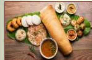
At Idli-Dosa Stalls