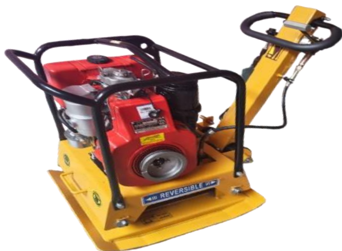
PLATE COMPACTOR C90T TECHNICAL SPECIFICATION