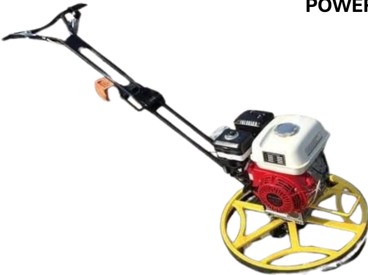
DMR900 TECHNICAL SPECIFICATION