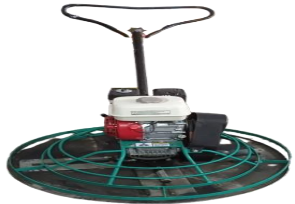
DMR1000 TECHNICAL SPECIFICATION