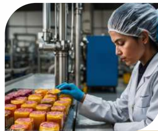
FOOD PROCESSING COMPNIES