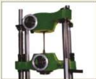
TENSION TEST (Standard)