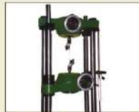
ATTACHMENT FOR TENSION TEST FOR WIRE ROPES

Tension test is conducted by gripping the test specimen between the upper and middle crosshead.