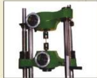
ATTACHMENT FOR TENSION TEST FOR SHOULDERED AND THREADED SPECIMENS