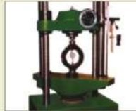
CALIBRATION OF MACHINE WITH PROVING RING