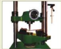
TRANSVERSE TEST (Standard)