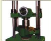
COMPRESSION TEST (Standard)

An elongation scale with least count of 1mm is provided for measurement of deformation on various samples.