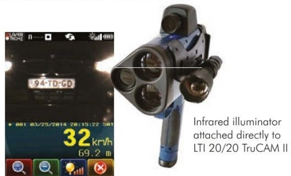
Infrared illuminator attached directly to LTI 20/20 TruCAM II

Continue to enforce violations throughout the night by using the side-mounted infrared illuminator.