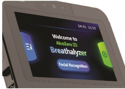
7.0 inch colour touch screen