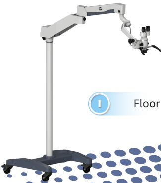
I Floor Stand