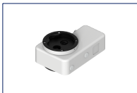
Optional: Full HD Integrated Camera

EMC 2014/108/EC EAR Regulation (EU) 2017/745 on Medical Devices Clinical Evaluation report as per EU MDR 2017/745 Technical documentation as per Annex II of EU regulation 2017/745 ISO 13485:2016 Certified facility