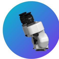
0°-210° Tilttable Binocular Eyepiece Tube