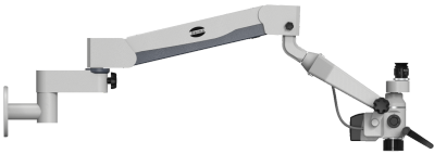
I Wall Mount