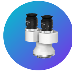
90° straight Binocular Eyepiece Tube