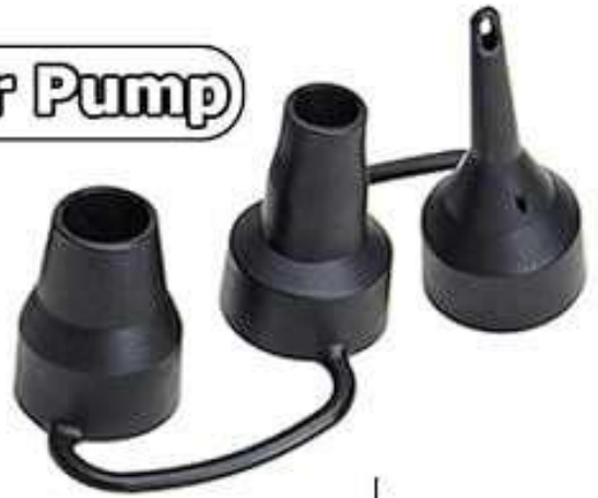
Air Pump Nozzles