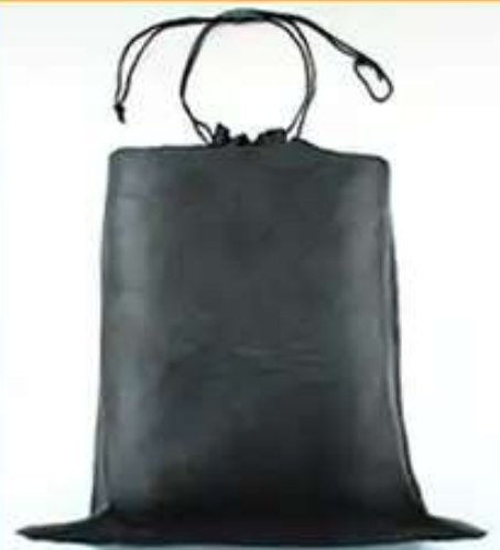
5. Storage bag