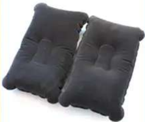
3. Headrest x2