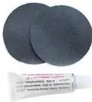
4. Repair bag + glue