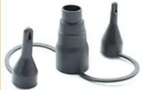
2. Three air nozzles