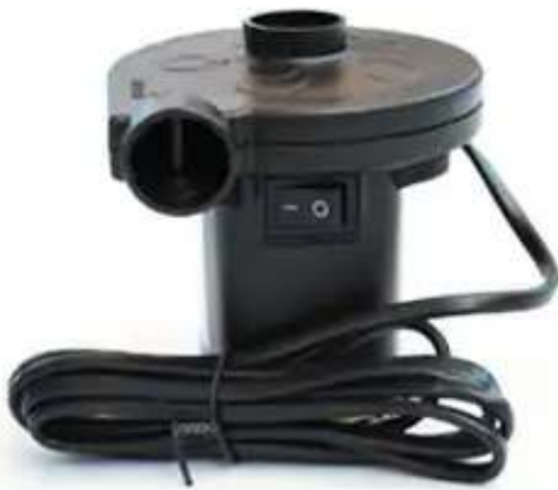
1. Charging pump

Air pump, three air nozzles, headrest X2, repair bag + glue, storage bag