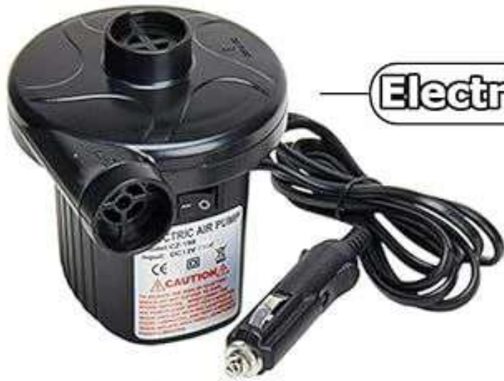
Electric Air Pump