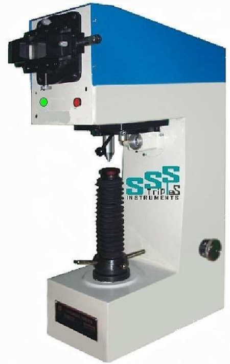
VICKERS HARDNESS TESTER MODEL : SSS-VM-50

To accommodate the high precision loading system & an optical projection screen, the machine frame is designed study. Specimen is placed on a testing table. The test cycle is fully automatic. The accurate load is applied on a diamond penetrator by means of a lever & weights. The load is removed automatically after a specific lapse of time. The objective is indexed with the test piece & the diamond indentation is projective is indexed with the test piece & the diamond indentation is projected on the measuring screen. The diagonals of the indentation can be measured by means of the micrometer screw of the projection screen