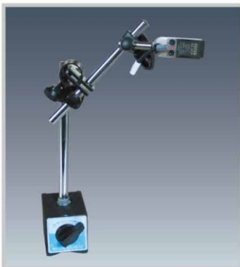
Middle Mold Detector