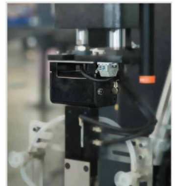
Claw rotating group