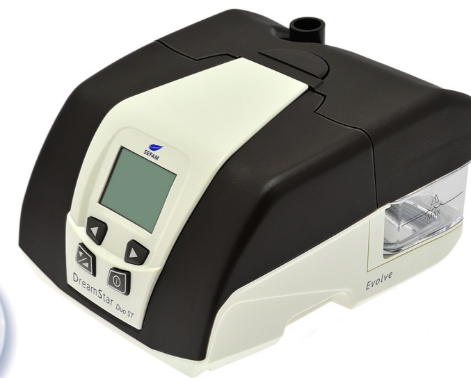
DreamStar™ DuoST Evolve w/ water reservoir

For more information contact us at the following addresses : customerservice@sefam-medical.com marketing@sefam-medical.com