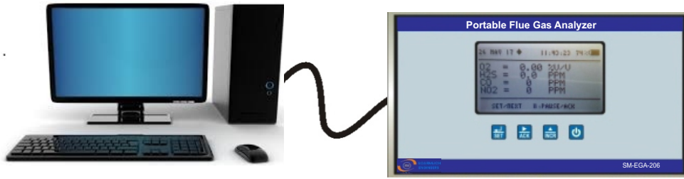
SM-EGA-206 CONNECTED TO A PC

Ambient and Emissions Monitoring Stack or Exhaust Gas Analysis in Boile Power & Industrial Plants Process Analysis Fuel Efficiency Internal Combustion Engines Furnaces Quality Control Labs