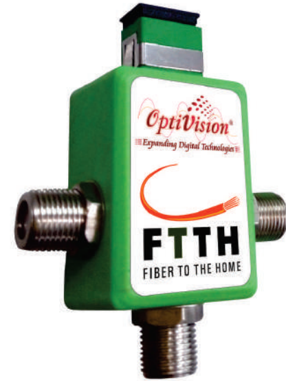
3way (0dBm = 66dB)