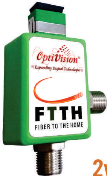
2way (0dBm = 68dB)