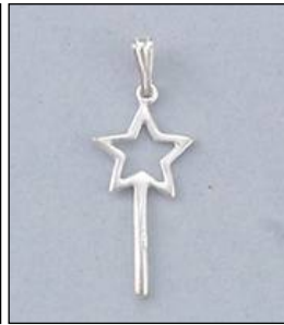
JCH128316SL WT: 0.6 gm