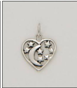
CH170544AT WT: 0.6 gm