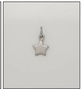
CH170600RH WT: 0.35 gm