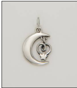
CH170527AT WT: 0.65 gm