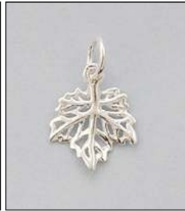
JCH170239SL WT: 0.55 gm