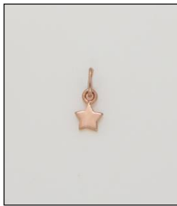
CH170596RG WT: 0.18 gm