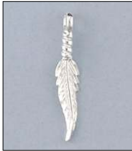
JCH128251DC WT: 0.8 gm