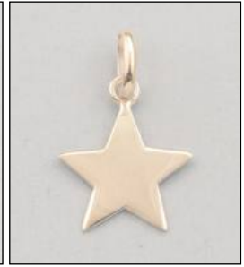
JCH170330SL WT: 0.7 gm