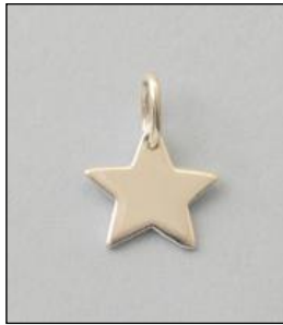
JCH170349SL WT: 0.5 gm