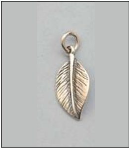
JCH170231AT WT: 0.72 gm