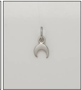
CH170598RH WT: 0.2 gm