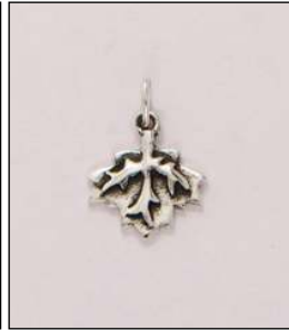
CH170773AT WT: 0.95 gm