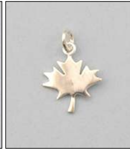
JCH170228SL WT: 0.72 gm