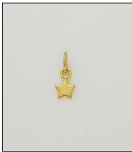
CH170596FG WT: 0.18 gm