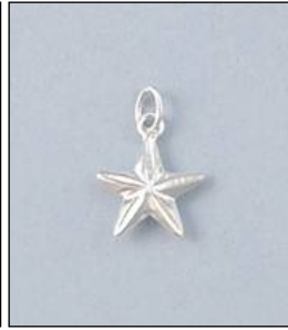
JCH128518DC WT: 1 gm