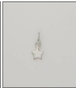
CH170596SL WT: 0.18 gm