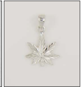
CH170659DC WT: 1.1 gm