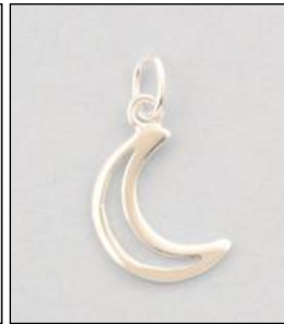
JCH170328SL WT: 0.35 gm