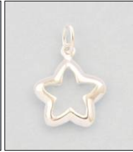
JCH170325SL WT: 0.95 gm