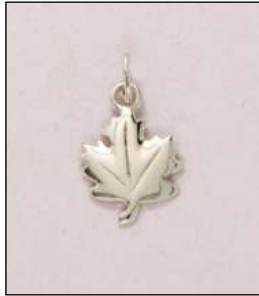
CH170761SL WT: 0.85 gm