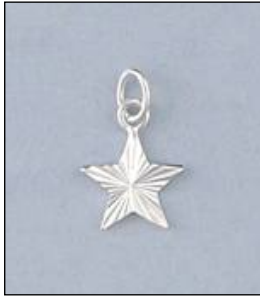
JCH128229DC WT: 0.41 gm