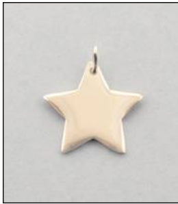
JCH170339SL WT: 1.05 gm