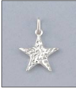
JCH128303DC WT: 0.63 gm