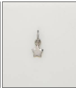
CH170596RH WT: 0.18 gm