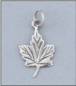
JCH128054AT WT: 1.16 gm