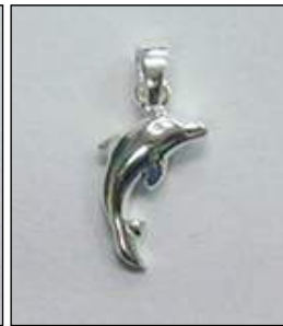
PD190645SL WT: 1 gm