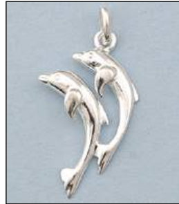
47821SL WT: 1.9 gm