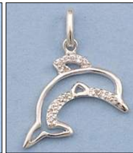
JCH170096A18SL WT: 0.03/1.17 gm