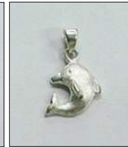
PD190659DC WT: 1.35 gm