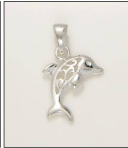
CH170566SL WT: 0.9 gm