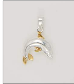
PD1900332T WT: 1.6 gm