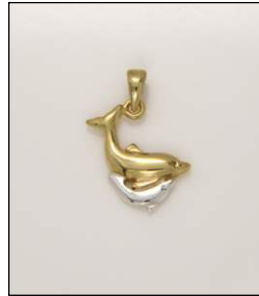
PD1607872T WT: 1.4 gm