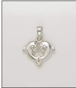
PD190034SL WT: 1.55 gm