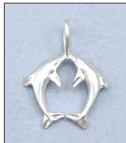
JP1250942T WT: 1.68 gm