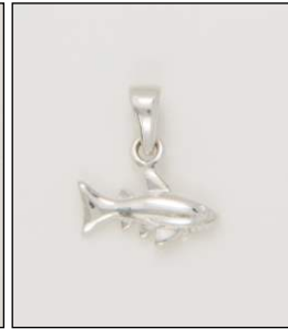
CH170667SL WT: 0.8 gm