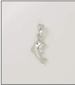
CH170670DC WT: 0.9 gm