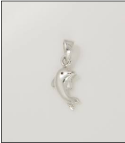
CH170670DC WT: 0.9 gm