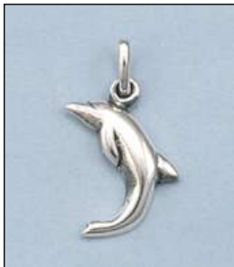
JP125350AT WT: 1.28 gm