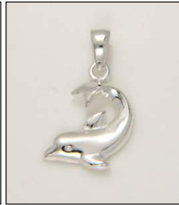
CH170567SL WT: 1.35 gm