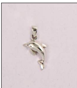
PD190464DC WT: 1.2 gm