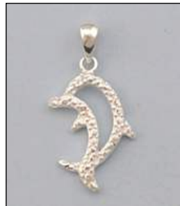
JP125973A18SL WT: 1.06 gm