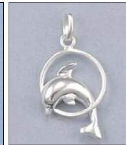
JCH1286552T WT: 1.68 gm