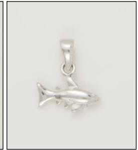
CH170667SL WT: 0.8 gm