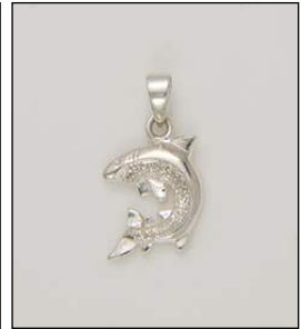
PD1900522T WT: 1.55 gm