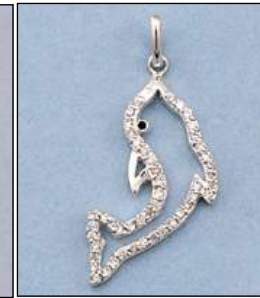
JCH170099A18EN WT: 0.1/1.55 gm