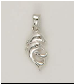
CH170565SL WT: 1.1 gm