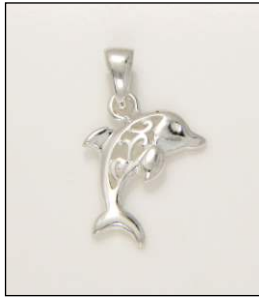
CH170566SL WT: 0.9 gm