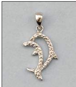
JP125973A18RH WT: 1 gm