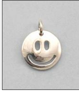
JCH170229SL WT: 1.01 gm