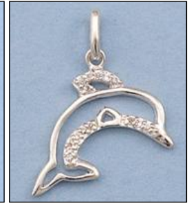
JCH170096A18SL WT: 0.03/1.17 gm