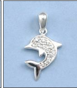
JCH128891A18SL WT: 0.071.08 gm