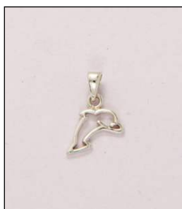
PD190505SL WT: 0.65 gm