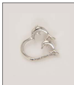
PD126384A18SL WT: 0.03/1.62 gm