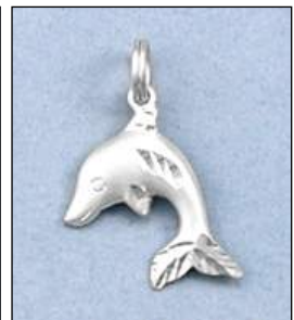
JP1251812T WT: 1.27 gm