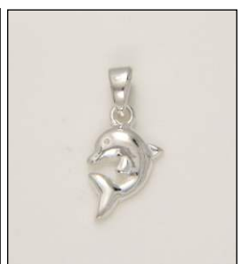
CH170564SL WT: 0.85 gm