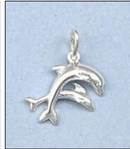
JP125152SL WT: 1.15 gm