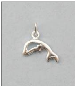
JP160158SL WT: 0.6 gm