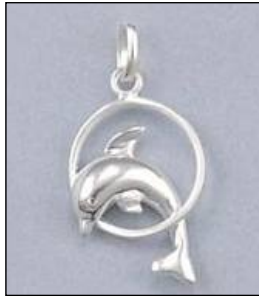
JCH1286552T WT: 1.68 gm