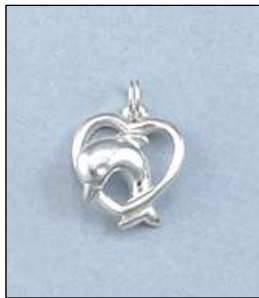
JCH128890SL WT: 1.4 gm