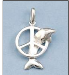
JP125329SL WT: 2.4 gm