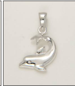
CH170567SL WT: 1.35 gm