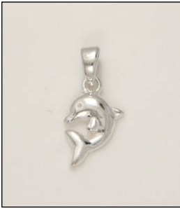
CH170564SL WT: 0.85 gm