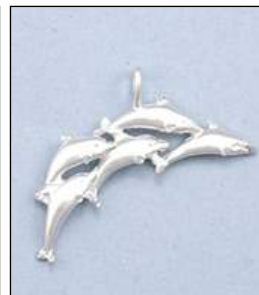
JP1251072T WT: 4.4 gm