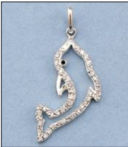
JCH170099A18EN WT: 0.1/1.55 gm