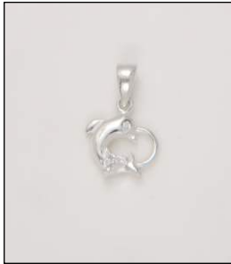
PD126329A18SL WT: 0.02/0.88 gm