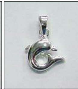
PD190646SL WT: 1.15 gm