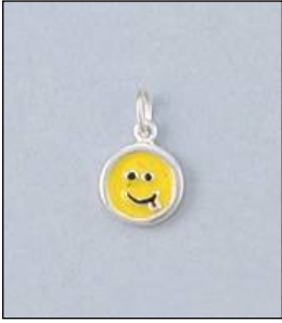
JCH128468EN WT: 0.8 gm