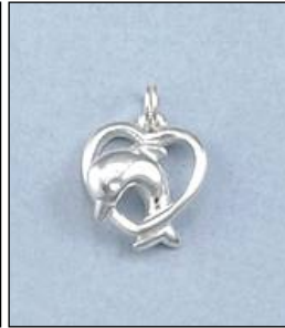
JCH128890SL WT: 1.4 gm