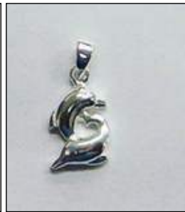
PD190644SL WT: 1.65 gm