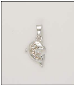
CH170668SL WT: 0.85 gm