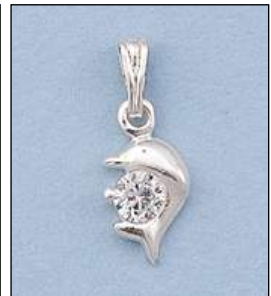
JP132138A18SL WT: 0.1/0.65 gm