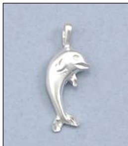
JP1249712T WT: 1.32 gm