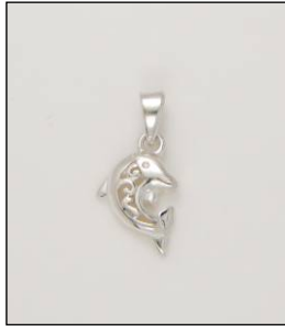
CH170668SL WT: 0.85 gm