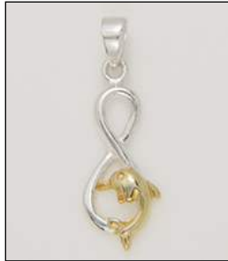
PD1901132T WT: 1.15 gm