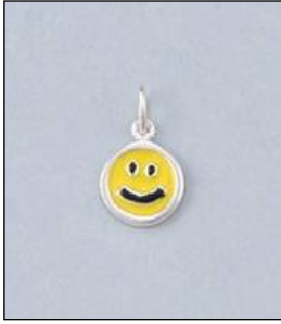
JCH128472EN WT: 0.77 gm