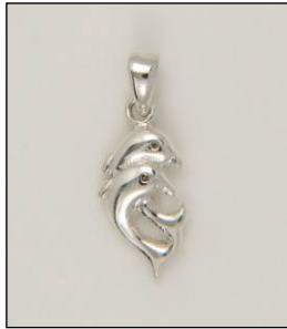
CH170565SL WT: 1.1 gm