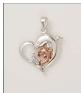
PD126383A182T WT: 0.03/2.82 gm