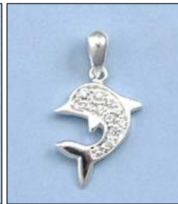
JCH128891A18SL WT: 0.07/1.08 gm