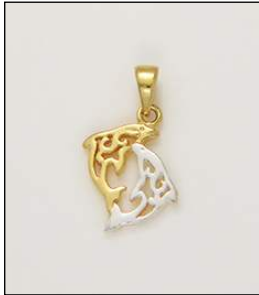
PD1900542T WT: 1.05 gm