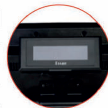
20 x 2 LCM Customer Display