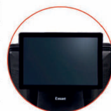
26.4 cm (10.4") LCD Customer Display