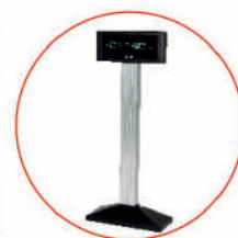
CD-615P Pole Type