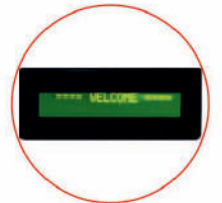
2 x 20 Characters, USB Interface Customer Display