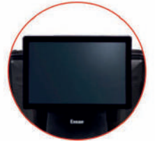
26.4 cm (10.4") Touch (PCAP) LCD, USB Interface Customer Display