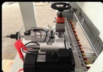
Horizontal drilling height regulator

https://www.youtube.com/watch?v=2IEudl_INJI&feature=youtu.be