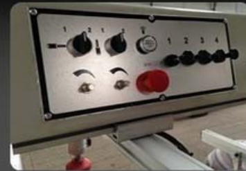
Button controlling platform