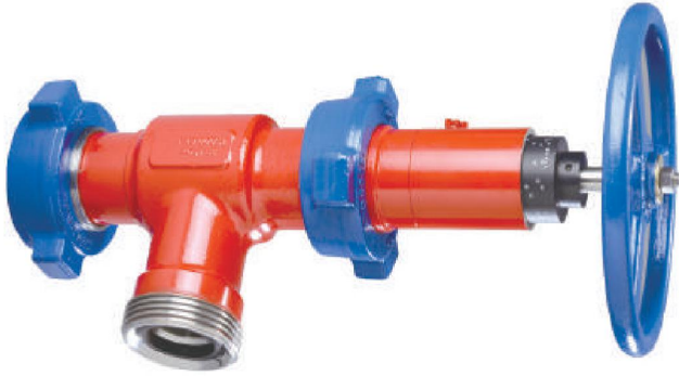
3" Adjustable Choke Valve