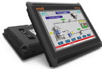
SP112-GT70 149(H) x 203(W)mm