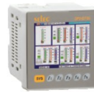
SP3-GT35 96(H) x 96(W)mm