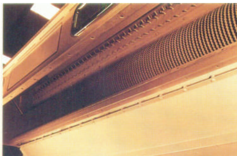
Front View of Serrated Discs