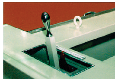
Variable set mote opening control

The amount of trash removed is controlled by the size of the adjustable mote opening. This opening can be adjusted during operation by a handwheel on the exterior of the machine. An external graduated scale having numbers 0 through 10 provides an adjustment reference point. Ejection of trash can be observed through a window on each end or through the door on the front. In the event of a tag forming in the constricting duct, a lever is provided on top of the cleaner to quickly move the mote opening to the full open position.