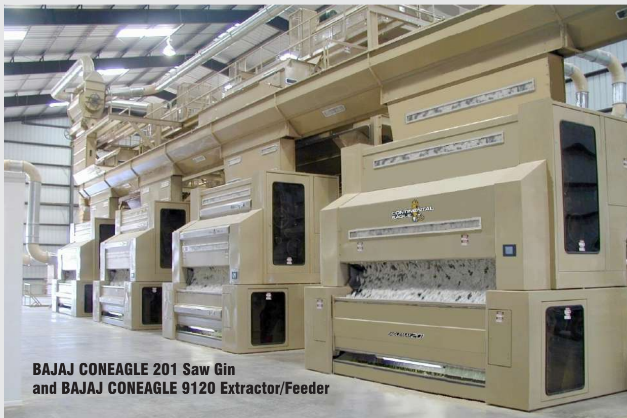
BAJAJ CONEAGLE 201 Saw Gin and BAJAJ CONEAGLE 9120 Extractor/Feeder