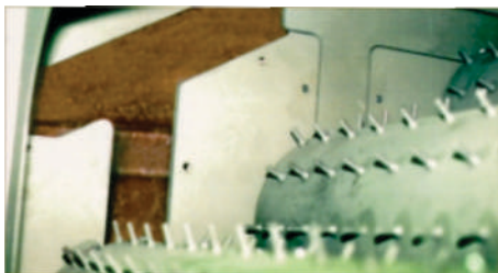
Segmented heads allow each cylinder to be removed without the complete dismantlement of the feeder.

Other features include 5 1/2" glass windows in the heads to aid adjusting brushes, grids, control bars and doffers. Two full width rectangular windows on front of the feeder allow viewing the flow of seed cotton.