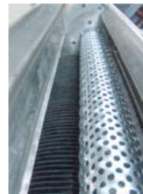
Seed Roll Tube & Conveyor