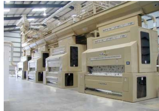
BAJAJ CONEAGLE EagleMax 201 Gin Stand and BAJAJ CONEAGLE 9120 Feeder