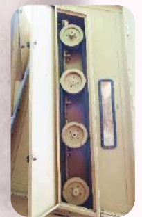
Taper Lock Pulley