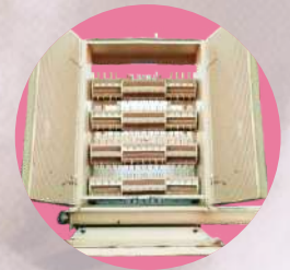
Trash Chamber with Roll, Jali & Screw Conveyor for trash & pink boll worm removal

“Quality is never an accident. It is the result of an intelligent effort. There must be a will to produce a superior thing.