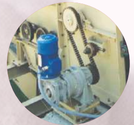
High Quality Branded Make Aluminum Gear Box