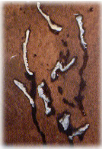
Photograph of worms killed in the first few minutes of zapping during a colonic irrigation treatment

A major source of toxicity are dental amalgams, which should be removed immediately and replaced with either gold fillings or modern compound ("white") fillings.