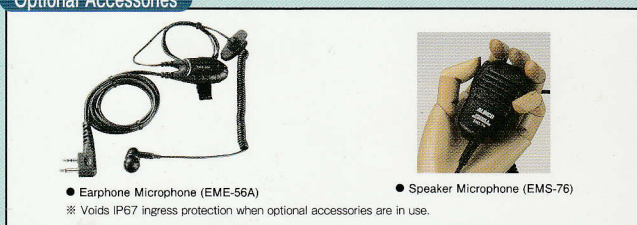
● Earphone Microphone (EME-56A) ● Speaker Microphone (EMS-76) ※ Voids IP67 ingress protection when optional accessories are in use.