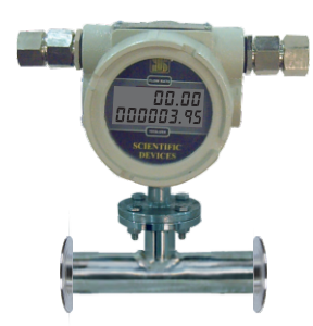
Product Code: MK- TFM-FR-TZ-TX-TC

With Field Mounted Flow Rate Indicator, Totalizer, 4-20 mA Out Put, Pulse Out Put, Low & High Flow Alarm