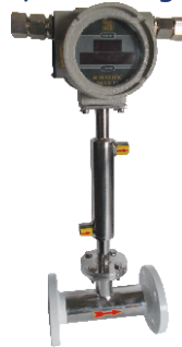
Product Code : MK-TFM-FR-TZ-TX-CJ

With Cooling Jacket Field Mounted Flow Rate Indicator, Totalizer, 4-20 mA Out Put, Pulse Out Put, Low & High Flow Alarm