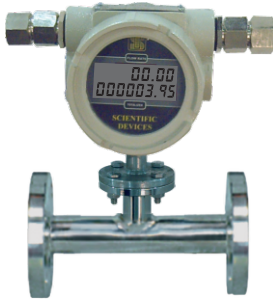
Product Code : MK-TFM-FR-TZ-TX-P

With Field Mounted Flow Rate Indicator, Totalizer, 4-20 mA Out Put , Pulse Out Put, Low & High Flow Alarm