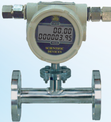
Product Code : MK-TFM Series

MYKO Electronics Turbine Flow Meters are useful for liquids & gases in general industrial application. They provide excellent performance with quality & reliability. Suitable for as hygienic application. The flowing media engages a vaned rotor causing it to rotate at an angular velocity proportional to flow rate. The pick-off coil senses the spinning motion of the rotor inside the pipe & converts it into a pulsating electrical signal. Summation of the pulsating electrical signal is directly related to the total flow. The frequency is linearly proportional to flow rate which is converted to mA signal by electronic circuitry. Flow rate Indicator/Totalizer/Transmitter and Controllers are available in Local/Remote and Panel Mounted Options. Design & Calibration Confirms to ISA-RP31.1