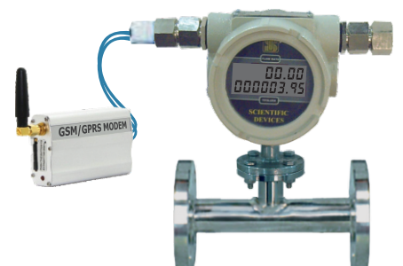
Product Code : MK-TFM-FR-TZ-TX-P-GSM

Data Communication of Turbine Flowmeter to centralized computers Via GSM/GPRS Modem