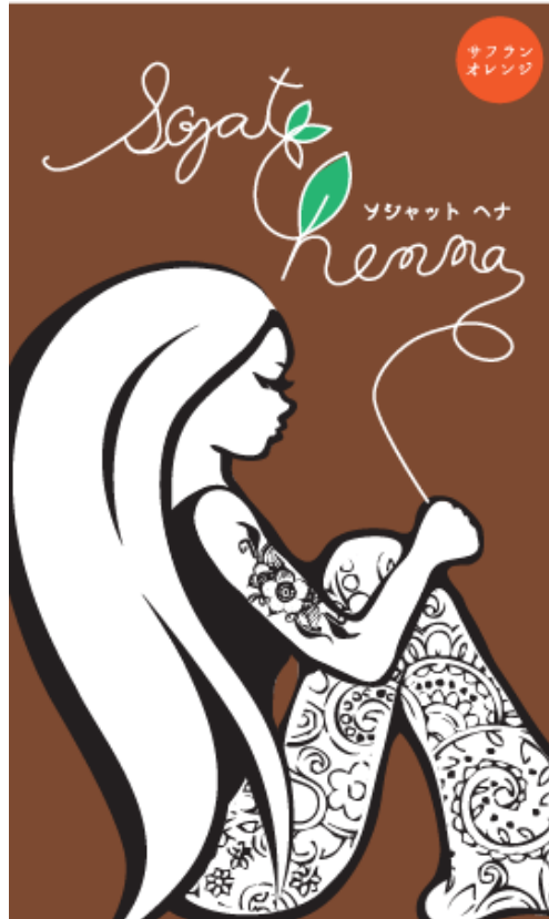
Sojat Henna Saffron Orange Net Weight: 100g Retail Price JPY2,730