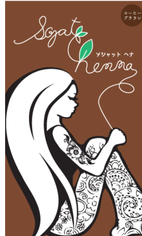
Sojat Henna Coffee Brown Net Weight: 100g Retail Price JPY3,780