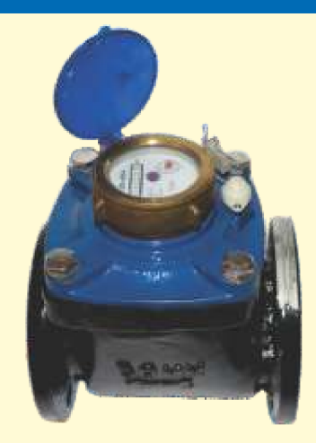
A removable mechanism type Woltmann water meter with magnetic drive and vacuum s ealed register.