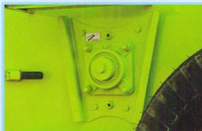
Bearing Support Plate