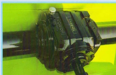
Heavy Duty Gear Box