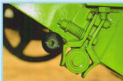
Stone Protection Tray