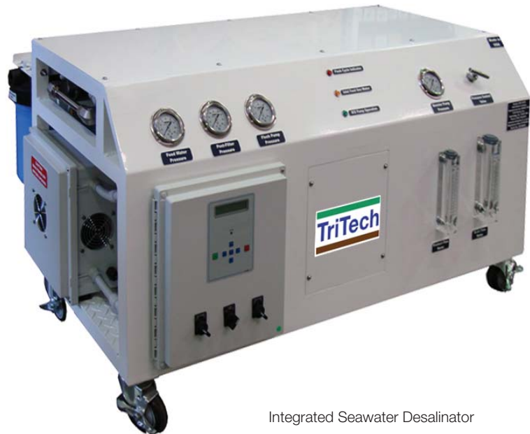
Integrated Seawater Desalinator

Previously, ocean fishing vessels, cruise ships and other large ships and jigs need to carry sufficient amount of drinking water to ensure the personnel water supply during sailing, which greatly occupied spaces and load capacities of the ships. By adopting RO technique, Trittech designed a marine and offshore seawater desalination equipment. Owing to its simple structure, convenient operation and other advantages, the equipment was gradually accepted by many oceangoing ships.