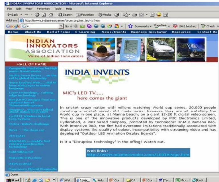
Our Product has been placed in Indian Innovators Forum http://www.indianinnovatorsforum.org/mic_led-tv.htm