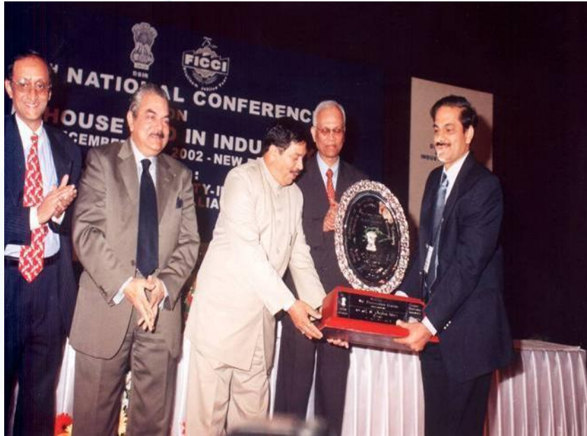
Department of Science and Industrial Research (DSIR) Award for MIC's Research and Development efforts in Electronics Industry