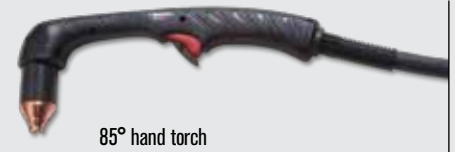
85° hand torch

(for more torch options, see www.hypertherm.com )