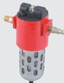
Air filtration kit