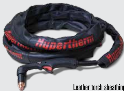
Leather torch sheathing