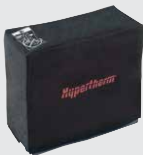
System dust cover