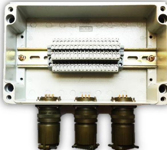
36 Terminal Junction Box with 9 Pin Connectors

Design & Information in this document is subject to change without notice