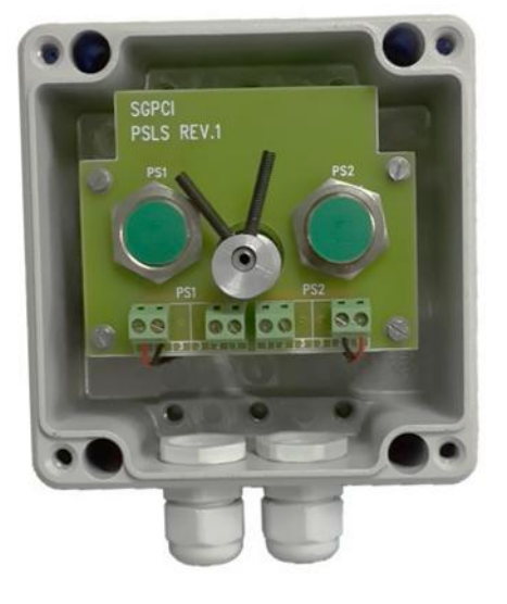
Limit Switch Box with Inductive Proximity Sensors