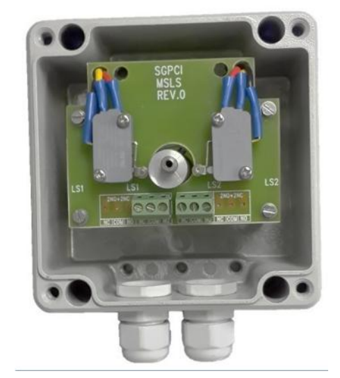
Limit Switch Box with electromechanical switches

It can also be supplied with in-built analog transmitter. Please refer our Position Feedback Transmitter for more details.