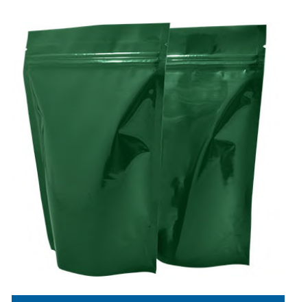
Green / Green