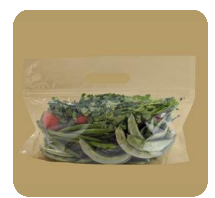
Stand up Pouch & Handle