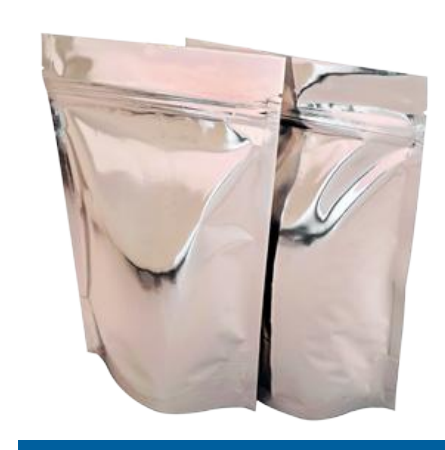
Shiny Silver/Shiny Silver