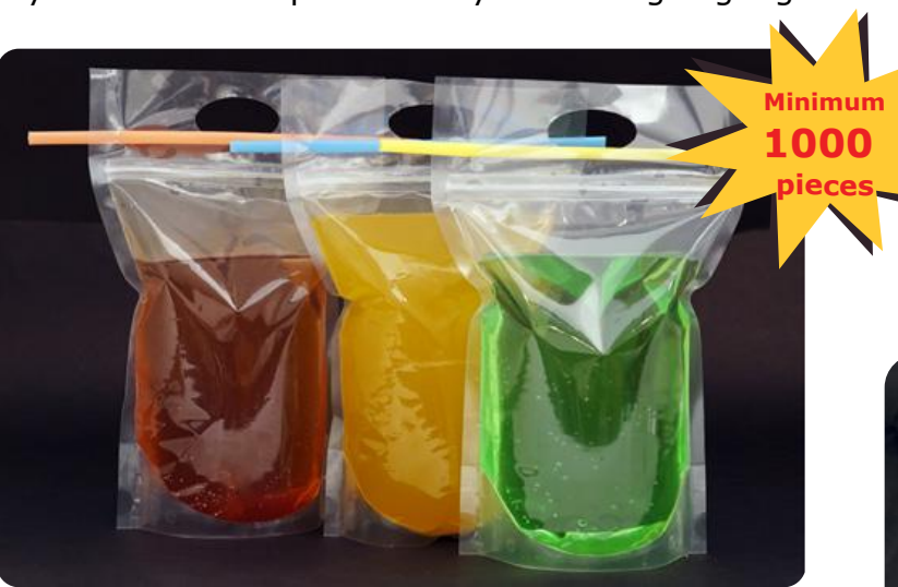
Café? Get rid of washing!

Try our new concept and see your sales going high!!