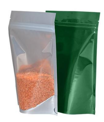
Clear / Green