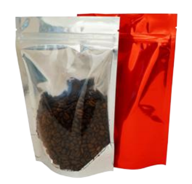
Clear / Red