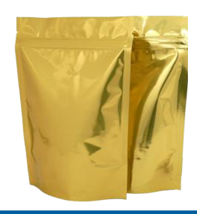
Shiny Gold / Shiny Gold