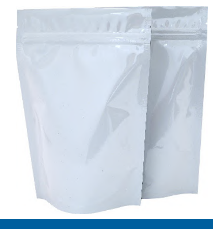
Shiny White / Shiny White