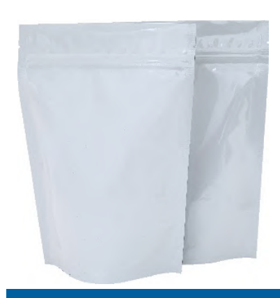
Matt White / Matt White