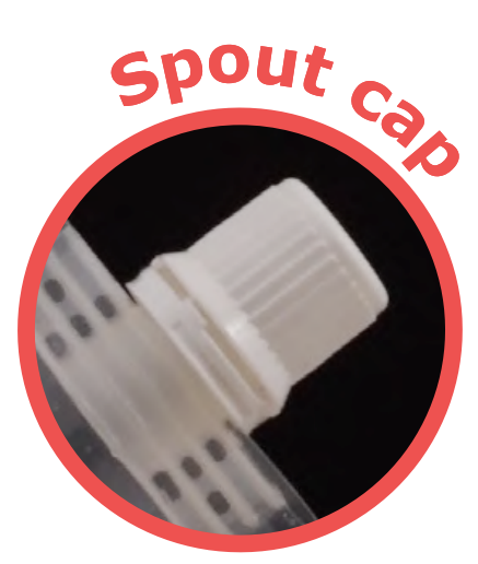
Please Call Us For Custom Printed Plastic Spouted Pouches