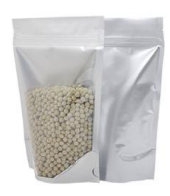
Clear / Matt Silver