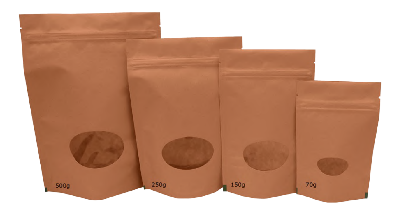
Please call us for custom printed Brown Paper Bags

Stand up pouch with oval window in brown paper is now available in different sizes. This pouches are not suitable for oily products because it do not have sufficient barrier so the oil sometime migrates on the top surface of bag and sometime the paper looks little oily. This pouch does not have sufficient oxygen and moisture barrier. So the life of the product filled inside will be less compared with other bags. If you require more barrier and oil protection in brown paper with window, than please use our brown paper full rectangle window bags.