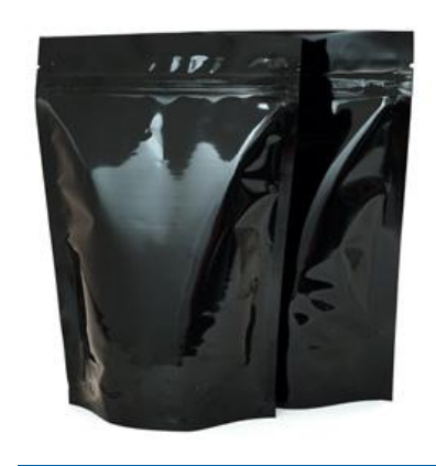
Shiny Black/Shiny Black