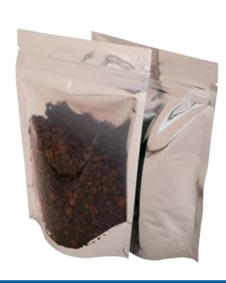
Clear / Shiny Silver