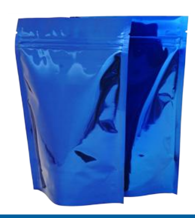
Blue / Blue