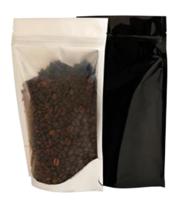
Clear / Black