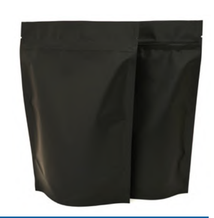
Matt Black/Matt Black