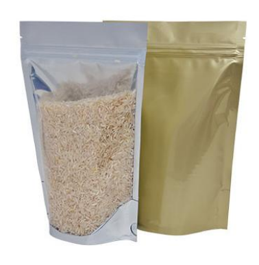
Clear / Matt Gold