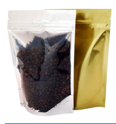
Clear / Shiny Gold