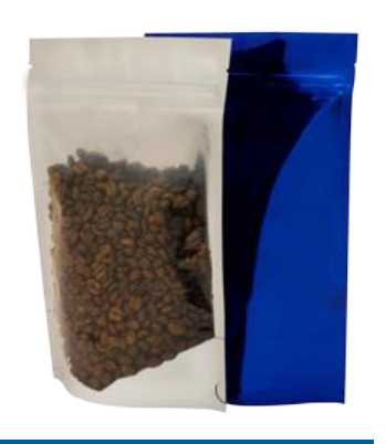
Clear / Blue