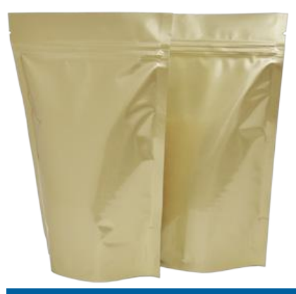
Matt Gold / Matt Gold