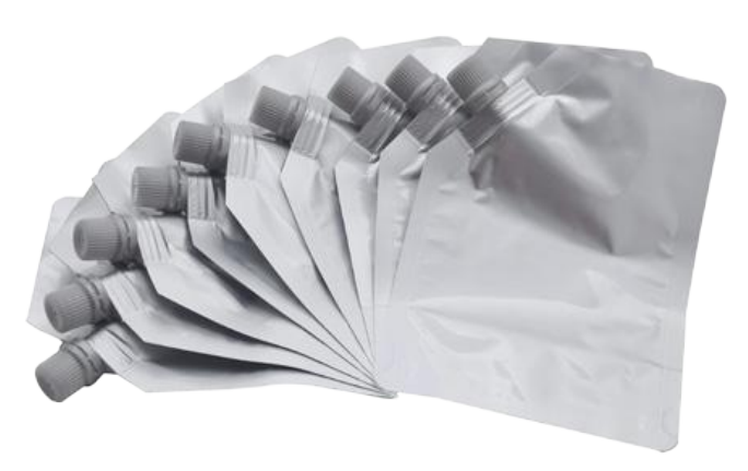
Uses 70% less Plastic then bottles