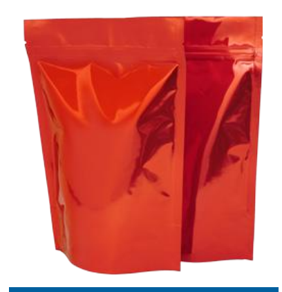
Red / Red